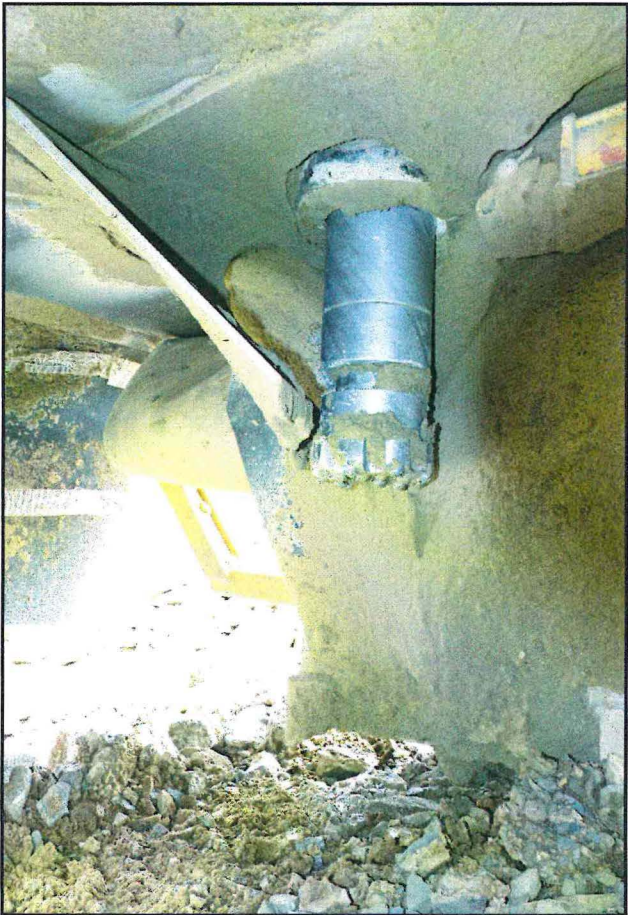
A peek at the drill rig's Atlas Copco drill bit.